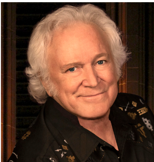
T. Graham Brown

T his year the Great Smoky Mountains Heritage Center is proud to celebrate its 15th year and will be hosting an in-person “ Heritage Happening Gala ” at the Hilton Knoxville Airport on the evening of Saturday, May 15, 2021, 5:00pm – 9:30pm . The evening will include dinner, on-line silent and live auction items for bidding, dancing, living history interpreters, photo opportunities, and live entertainment from the legendary T.G. Sheppard and T. Graham Brown .