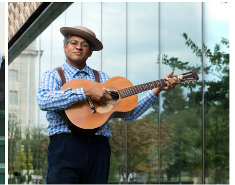
▲ Dom Flemons