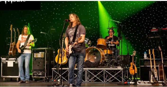
▲ The Ultimate Eagles Tribute