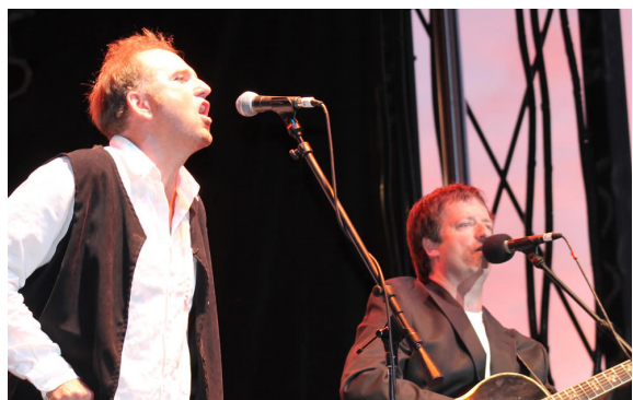
▲ Simon and Garfunkle Tribute