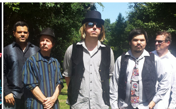
▲ The National Tom Petty Tribute