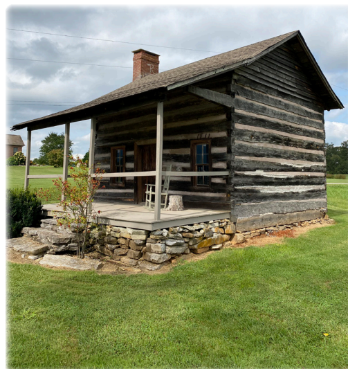
▲ THE DAVIS CABIN PRIOR TO DISASSEMBLY AND STORAGE.

Stay tuned for exciting news on the future use of these valuable heirlooms.