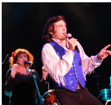
▲ Neil Diamond Tribute