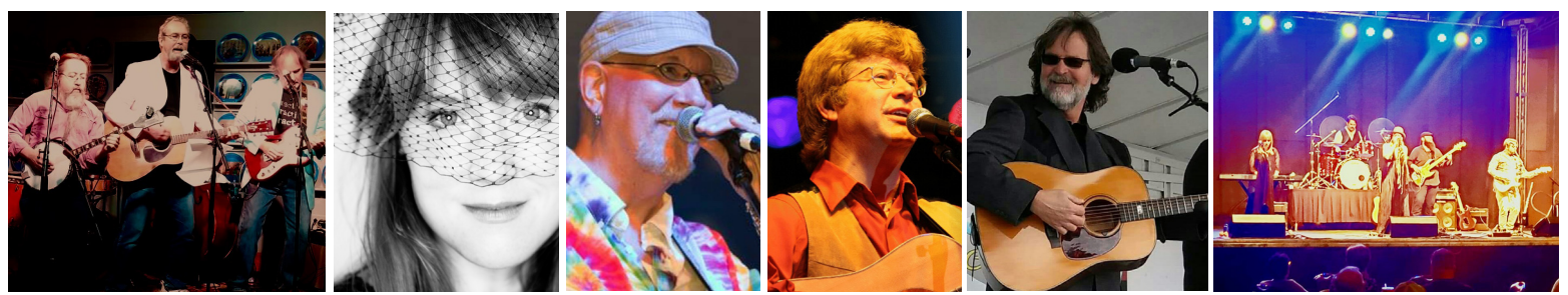
▲ Pistol Creek