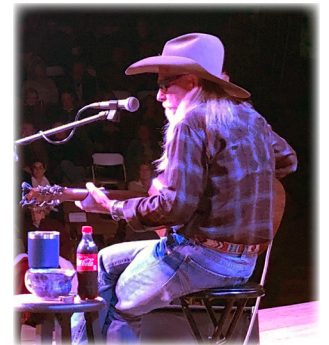
▲ Renowned singer song-writer Dean Dillon plays to a packed house in October 2021

► To order your tickets call 865-448-0044 or visit our website at www.gsmheritagecenter.org