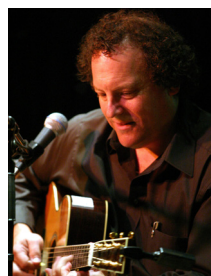
▼ Appalachian Road Show