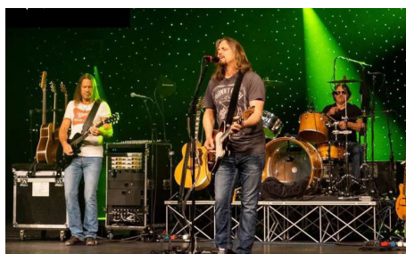
▲ The Ultimate Eagles Tribute