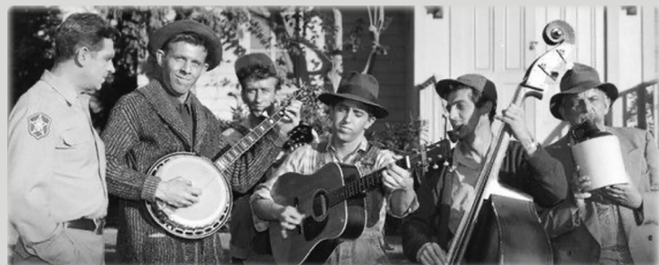
The Dillard Family performed as "the Darlings" on the Andy Griffith Show.