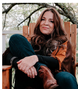
▲ Carlene Carter