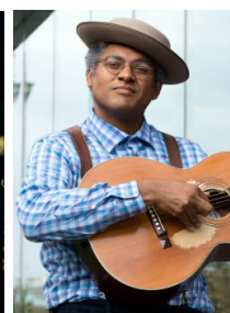
▲ Dom Flemons