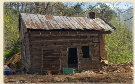
Keller Cabin on its original site.