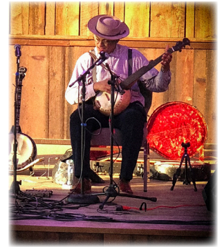
▲ Dom Flemons captivates the audience in 2021 with authentic musical arrangements from olden times.