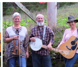
▲ Wild Blue Yonder