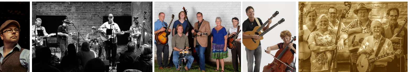
▼ Dismembered Tennesseans