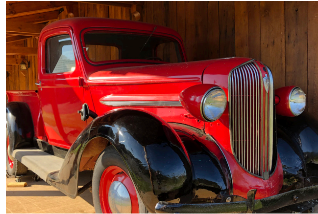
One of our vintage trucks glows in the Autumn sunlight.