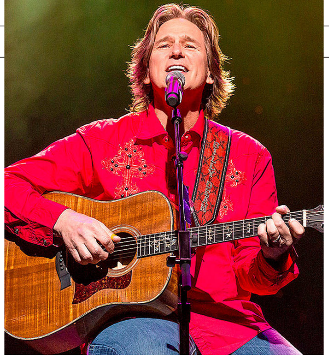
The Amphitheater is an open-air facility, so dress warmly and bring a blanket to enjoy this intimate, holiday performance! Social distancing will be enforced and seating is limited due to COVID-19 restrictions.

All ticket holders will receive Free Candlelight Tours of the historic Appalachian Village prior to the show. A Food Truck will be on site with warm spirits and more.